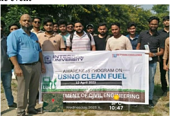
Students and faculty coordinator